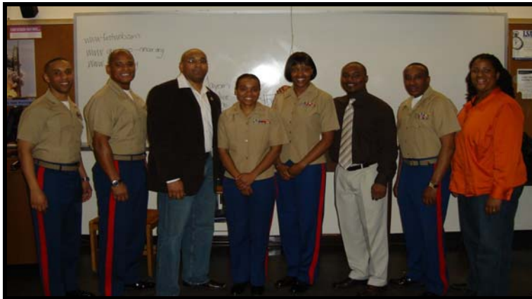
Quantico Chapter members pose with other James Farmer Scholars volunteers after a one-hour career panel.