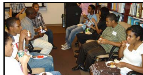
The DC BDPA team enjoys lunch following the first two rounds of competition.